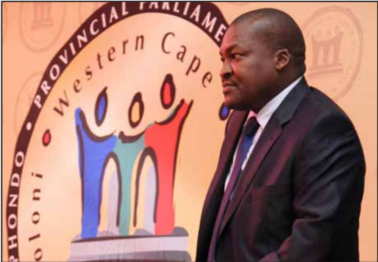
The Speaker delivering his opening address at the Youth Programme presented at Chrysalis Academy in June 2012