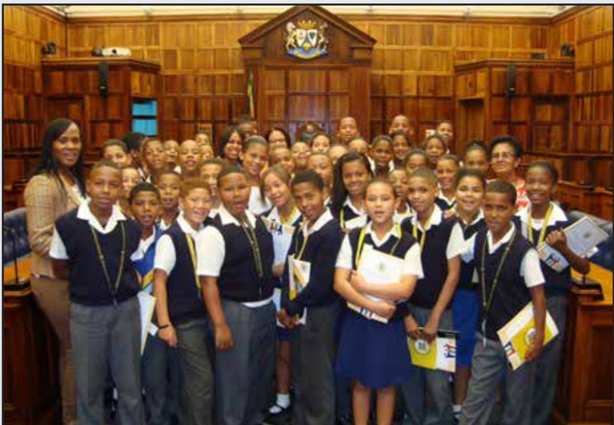
Learners from Hermeslaan Primary, Atlantis, visiting the WCPP