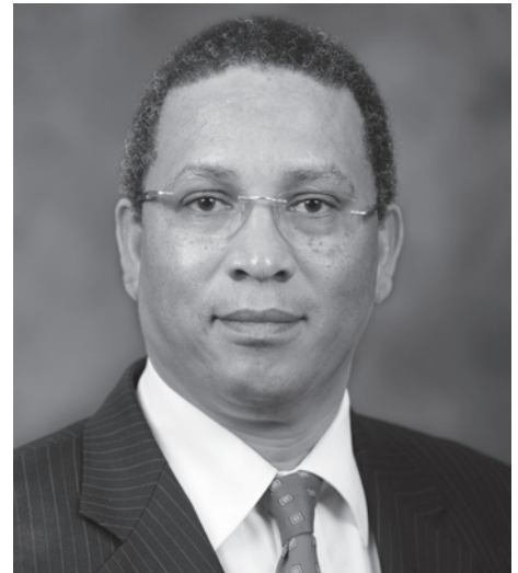
Dr Ivan Meyer Minister of Agriculture

Dr IH Meyer Minister of Agriculture Western Cape Government Date: 31 July 2020